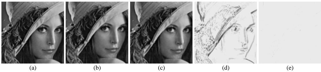
Figure 3: Registering “Lena”. (a) Reference image. (b) Distorted image. (c) Reconstructed image. (d) Difference between (a) and (b), rms error is 32.9. (e) Difference between (a) and (c), rms error (excluding boundary regions) is reduced to 4.7.